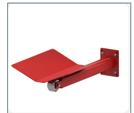
Boom with wheel + V support