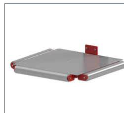
Platform with rollers