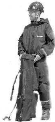
Fig 1. Set proportion