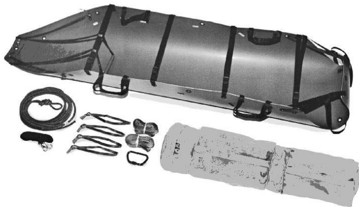
Fig.2. Set DX020 components