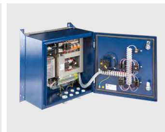
Option: frequency converter