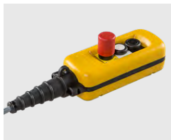
Option: control pendant