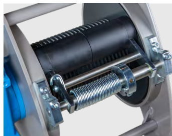
Option: pressure roller

Delivery time for version frequency converter approx. 25 days