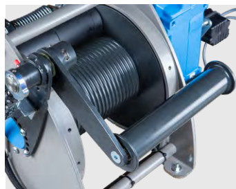
Option: slack rope switch