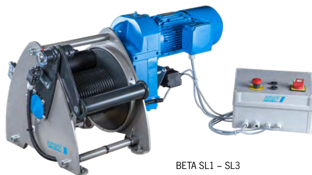
BETA SL1 – SL3